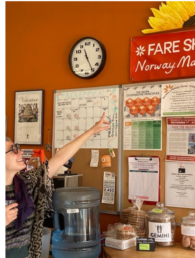
Fare Share Food Co-op, Norway, ME