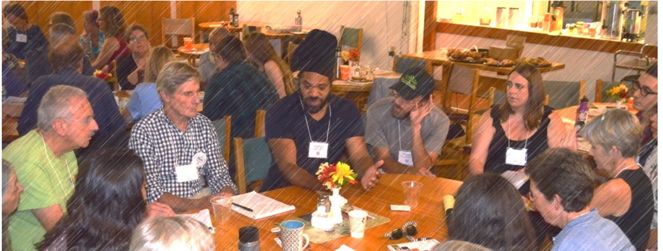
Neighboring Food Co-op Association Peer Networking Gathering for Board Leaders.