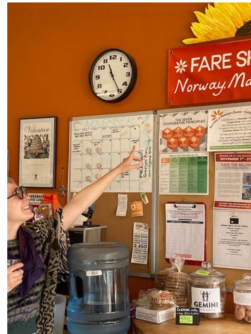
Fare Share Food Co-op, Norway, ME