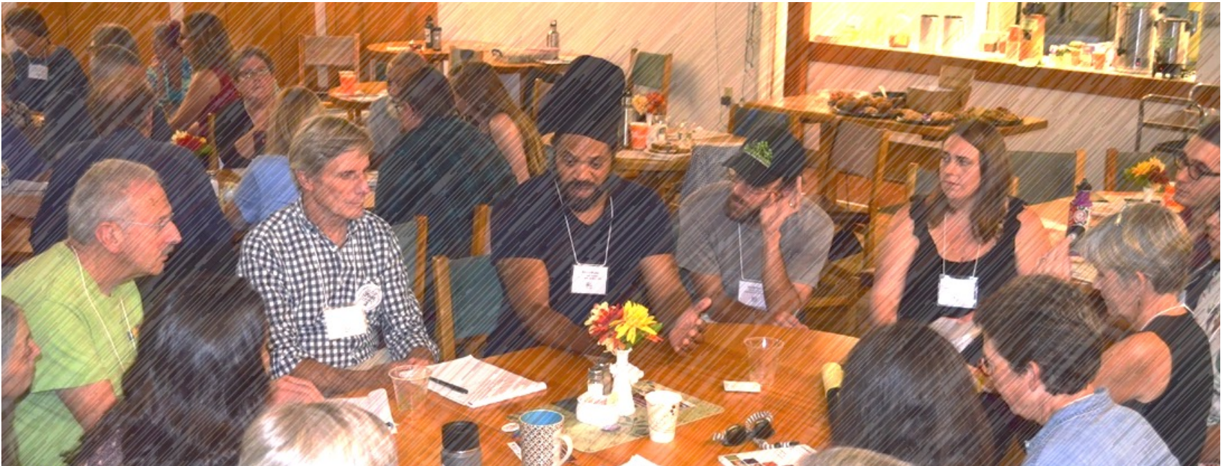
Neighboring Food Co-op Association Peer Networking Gathering for Board Leaders.