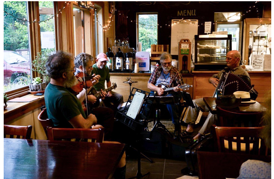
Leverett Village Food Co-op, Leverett, MA