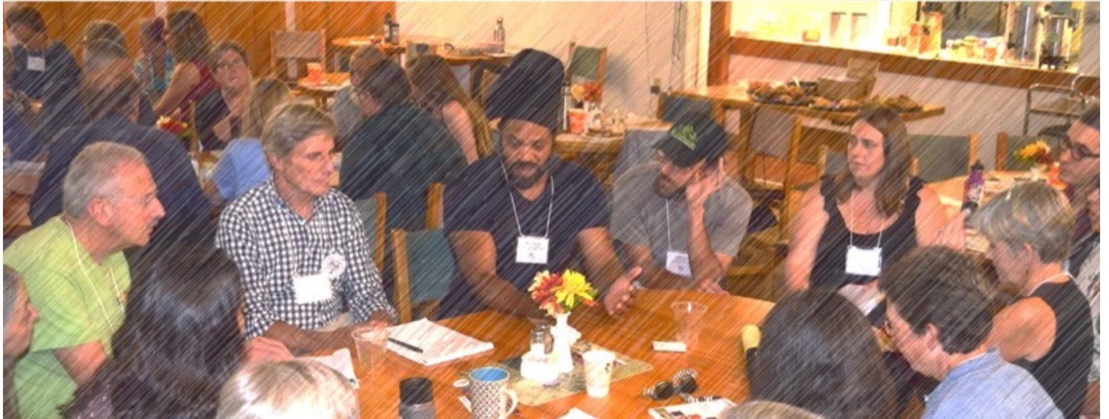
Neighboring Food Co-op Association Peer Networking Gathering for Board Leaders.