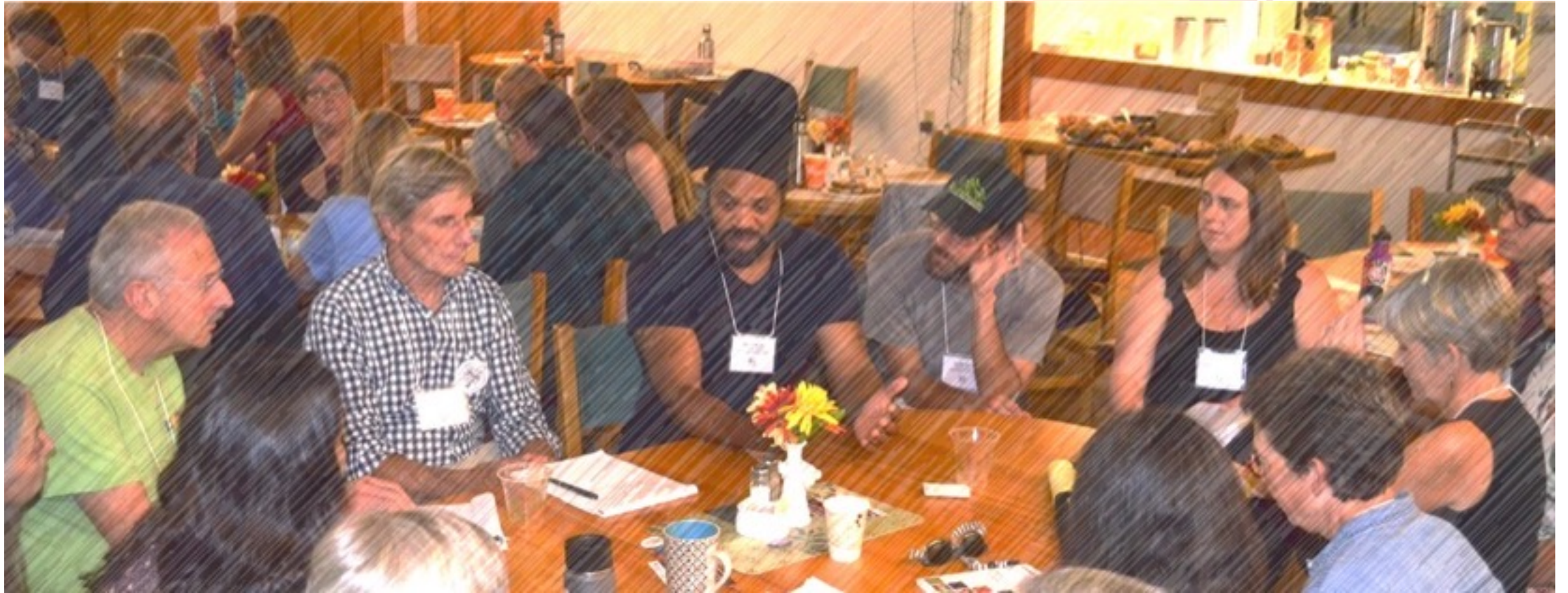
Neighboring Food Co-op Association Peer Networking Gathering for Board Leaders.