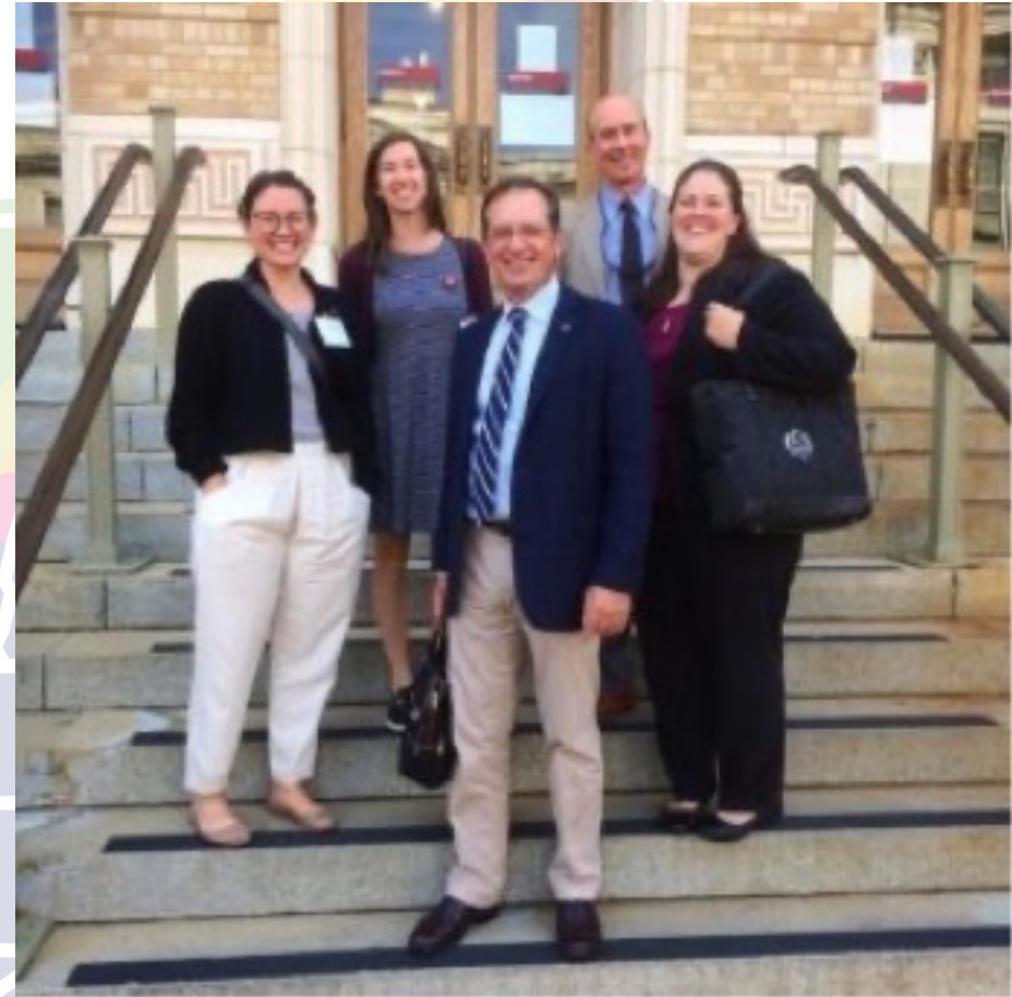
NEFU's 2019 Fall Legislative Fly-in Representatives — Farmers & Food Co-ops, together!