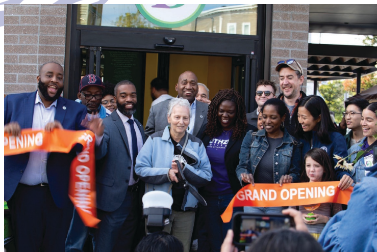
Dorchester Food Co-op celebrating their Grand Opening on October 14th, 2023