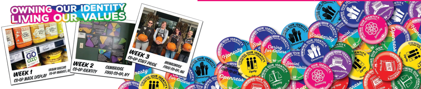
Some of our Neighboring Co-ops celebrating the 2023 Co-op Month theme: Co-operation: Our Foundation; during our yearly Co-op Month Weekly Photo Contest.