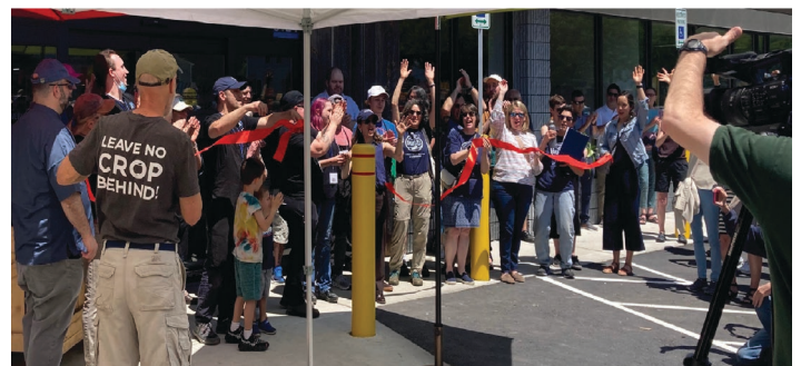
Assabet Co-op Market’s Grand Opening on May 31st, 2023